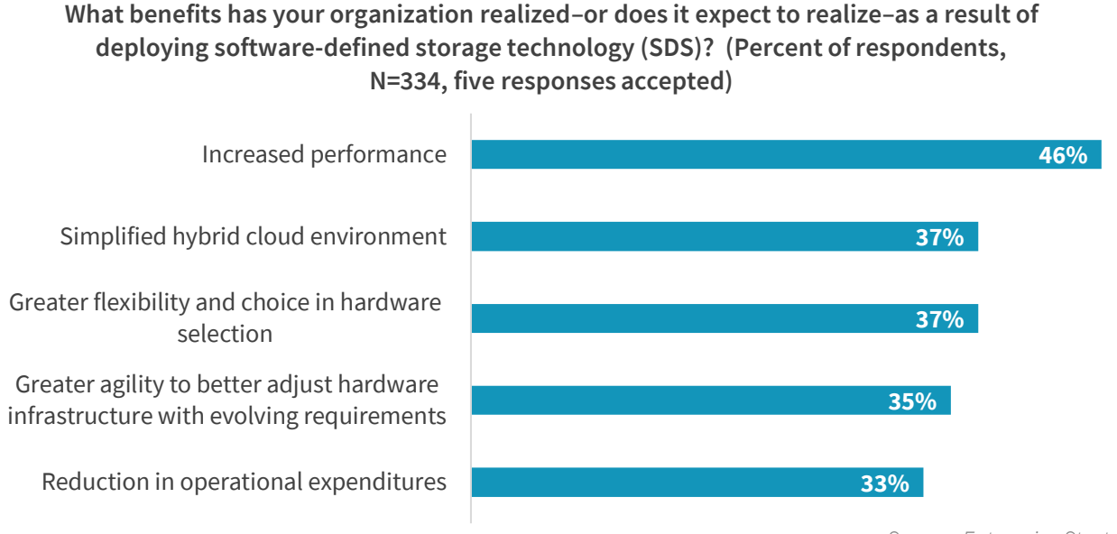
Figure 1. Top Five Realized/Expected Benefits of SDS

Somewhat surprisingly, however, increased performance was the most commonly identified benefit, surprising given that performance is often determined mainly by hardware. With its ability to offer greater freedom in the choice of hardware, SDS could support performance improvements, as high-performance components could be more easily integrated into the system.