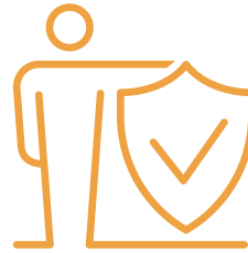
Advanced Persistent Threats