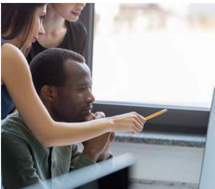
The Covenco service package includes Veeam Backups on Cloud Connect, a dedicated firewall, plus Tape-Out and the provision of Disaster Recovery hardware.