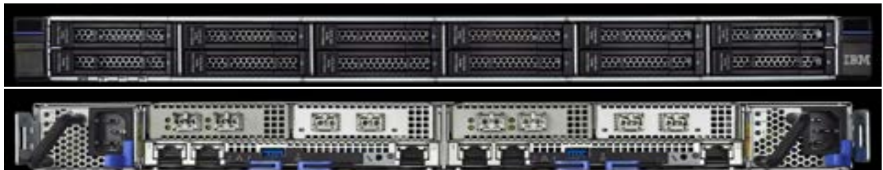
Figure 1 IBM FlashSystem 5200 front view (top) and rear view (bottom)

This IBM Redpaper™ publication is intended for mid-market clients.