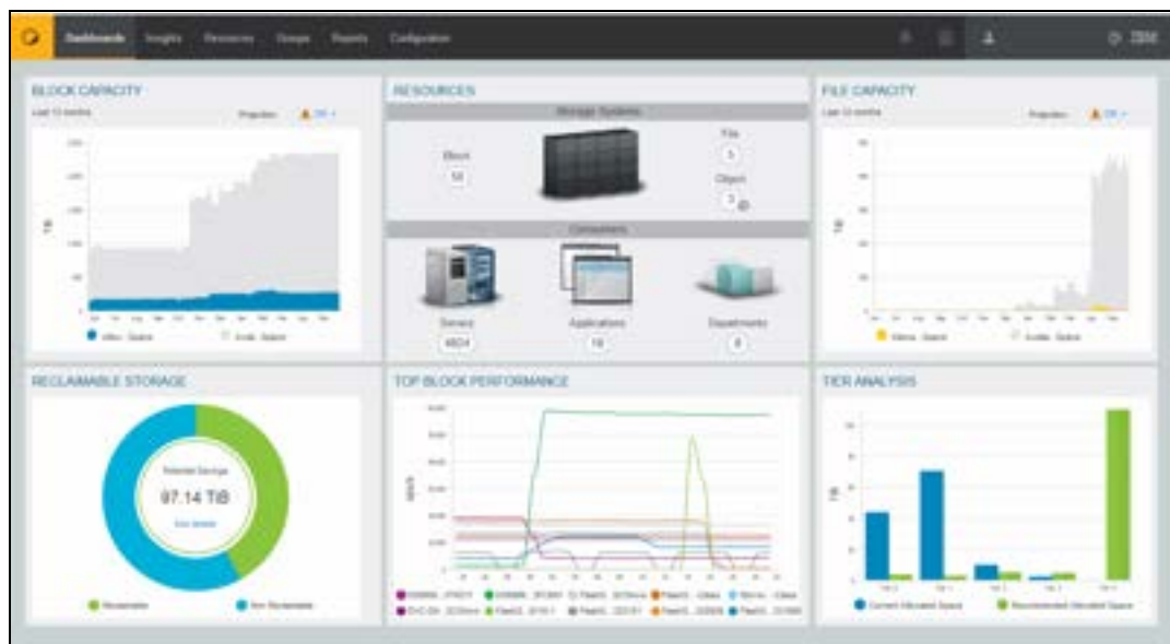
Figure 4 Storage Insights dashboard

Cloud-based IBM Storage Insights provides a single dashboard that gives you a clear view of all of your IBM block storage (see Figure 4). You can make better decisions by seeing trends in performance and capacity. With storage health information, you can focus on areas that need attention. IBM Storage Insights provides a clear view of your environments without the need to install or maintain complex software.