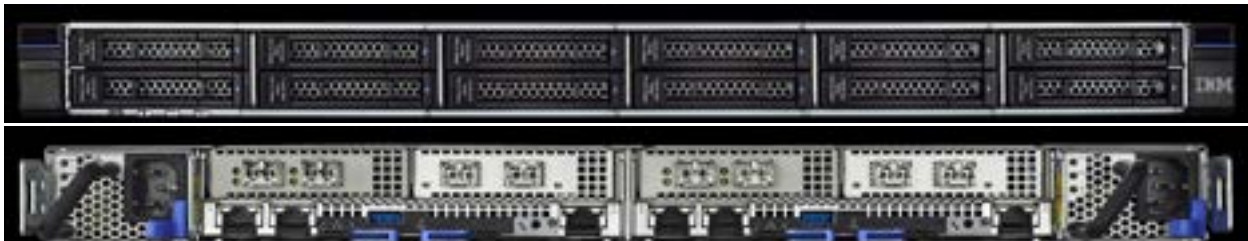
Figure 1 IBM FlashSystem 5200 front view (top) and rear view (bottom)

This IBM Redpaper™ publication is intended for mid-market clients.