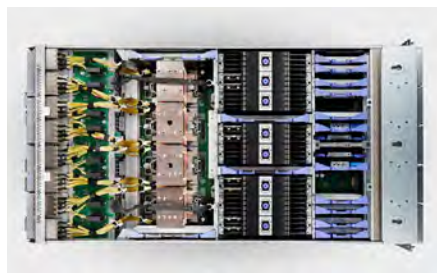
IBM Power10 servers are based on IBM's unique Power processors and are capable of running AIX®, IBM i and Linux®. They help modernise business applications with agility, reliability and sustainability.