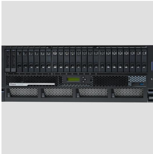
Figure 1. IBM Power S1124